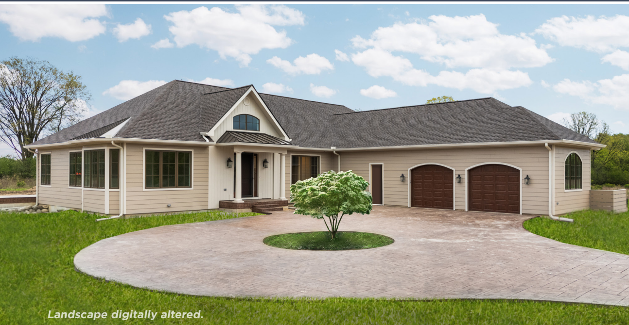
Landscape digitally altered.