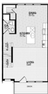
LINCOLN MAIN LEVEL