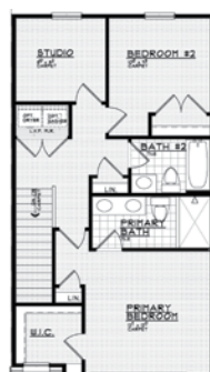
LINCOLN OPTIONAL BEDROOM LEVEL

RB ROBERTSON BROTHERS HOMES 80 TH ANNIVERSARY