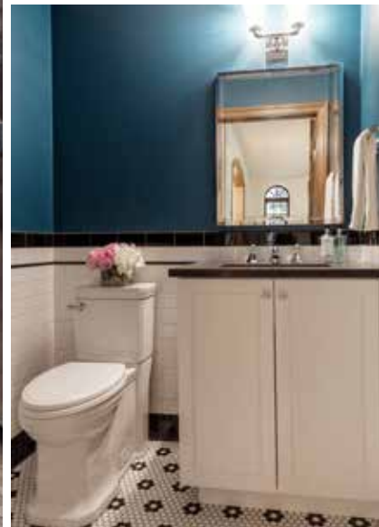
Sean Carter Photography