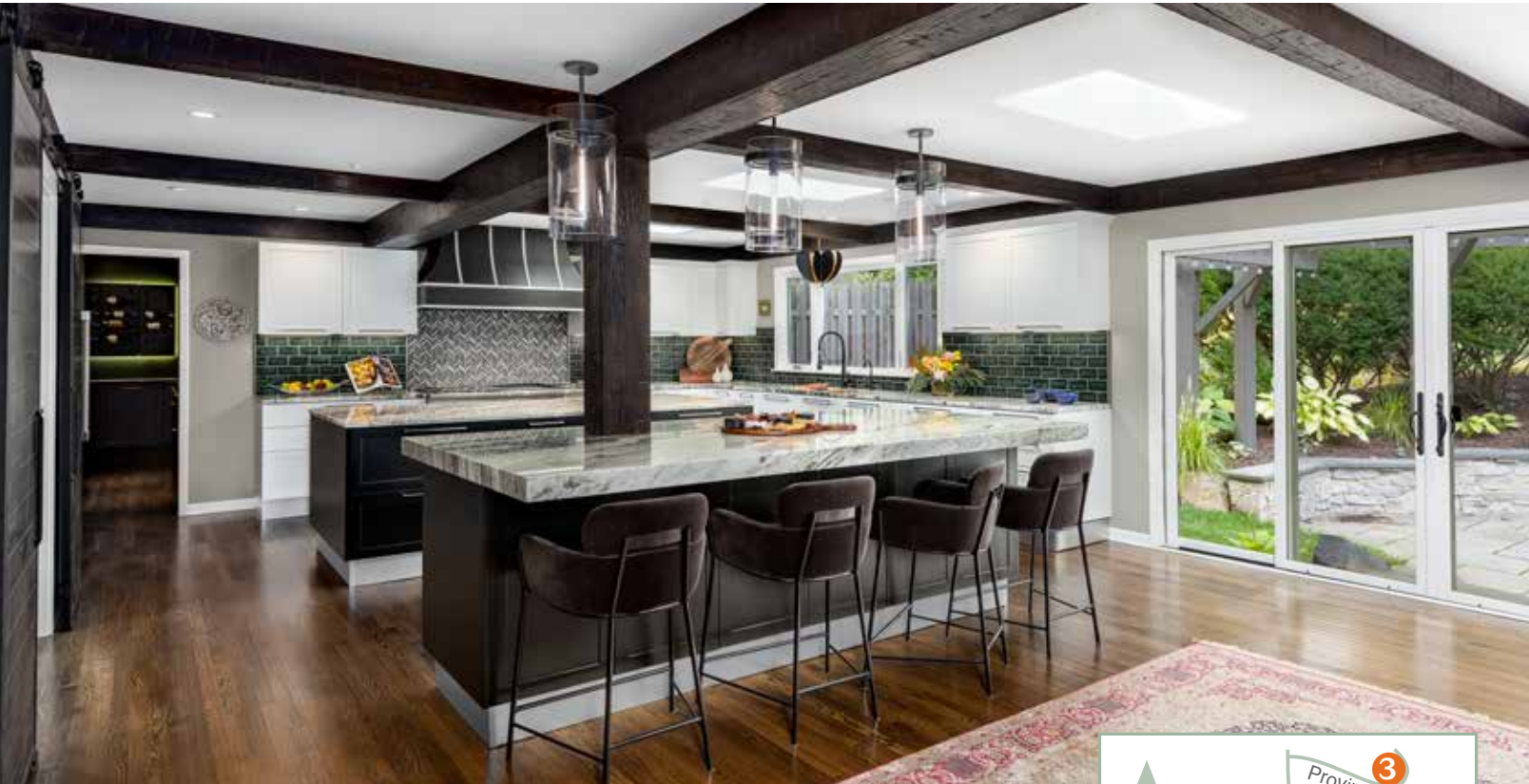
Laura McCaffery Photography

Kitchen Remodel Plus Primary Suite Addition