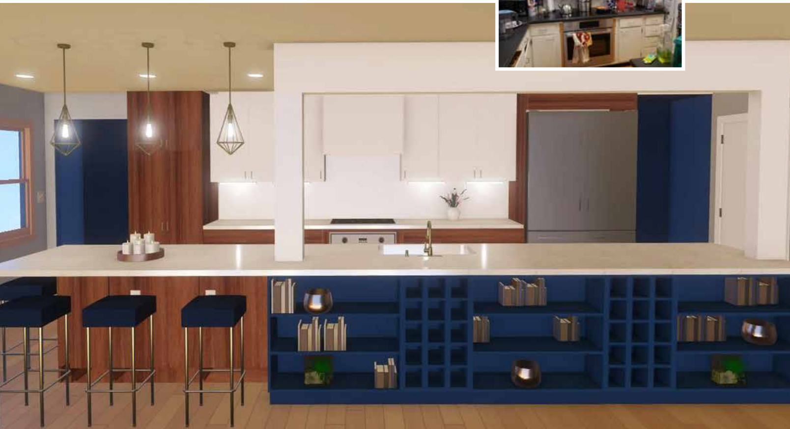
3-D Rendering by Alpha Design+Build