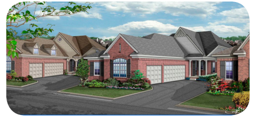
Above: Conceptual rendering. Example pictured differs from current model. (Photo not yet available at time of printing)